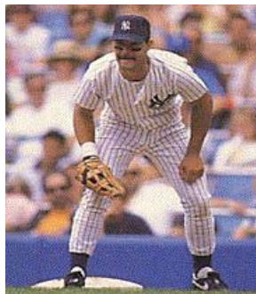
Don Mattingly in a classic pose.

Yankees. A plaque is expected to be added to the famous "Monument Park" that sits behind home plate. Thirteen other people have had their number retired by the Yankees. Besides Jackie Robinson's number 42 which was retired for all of Major League Baseball earlier this year, the last person to have his number retired was Reggie Jackson on August 14, 1993. Donnie joins