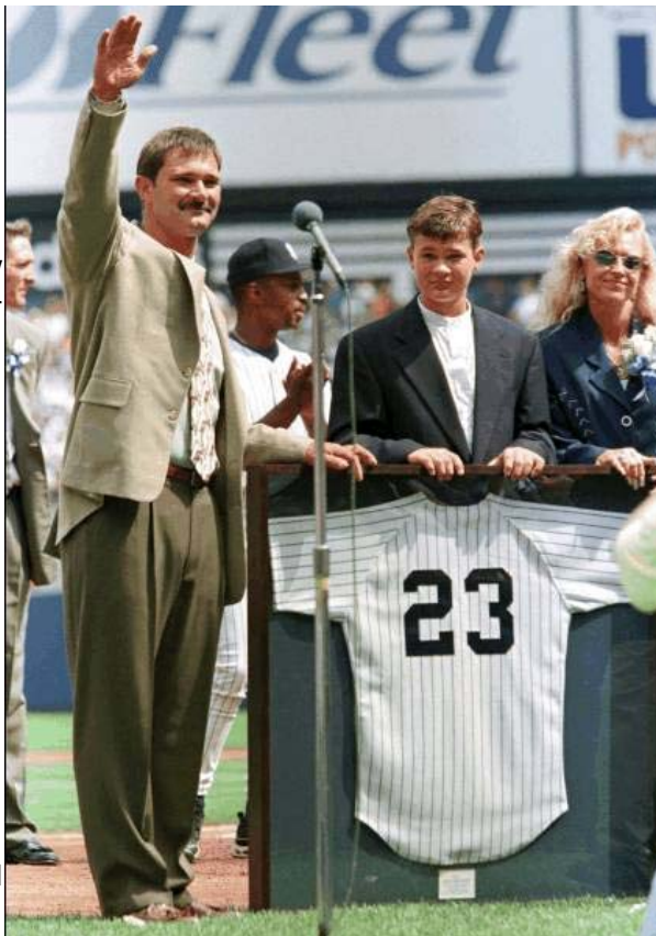
Don, Taylor and Kim Mattingly with the newly retired #23. Dave Righetti and Willie Randolph are in the background.

The pre-game ceremony was filled with many highs. Many of Don's old